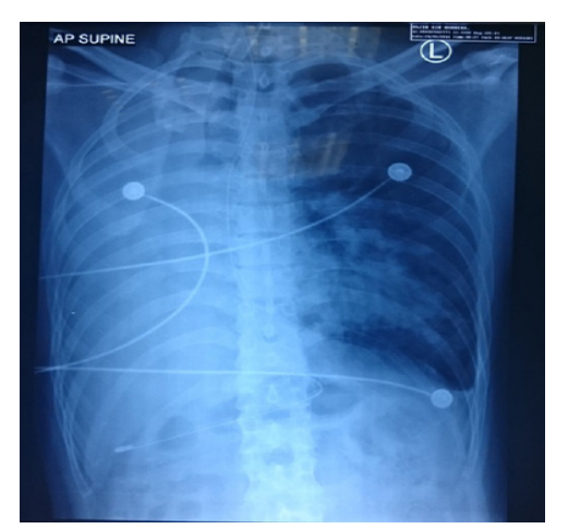
Figure 1: CXR post-intubation before any bronchoscopy and suctioning intervention. Right lung atelectasis and shifting of trachea towards right lung noted.

bpm, and oxygen saturation (SpO<sub>2</sub>) 36% (under room air). Patient was resuscitated with fluids and was put on inotrope IVI dopamine 5 mcg/kg/ min. Intubation was attempted but failed due to stiff neck. Bag-valvemask ventilation was performed and saturation was able to be maintained at 100%. He was immediately transferred to a tertiary referral hospital for further management. The referral to the tertiary hospital was made prior transfer, so the receiving team was ready to receive the patient.