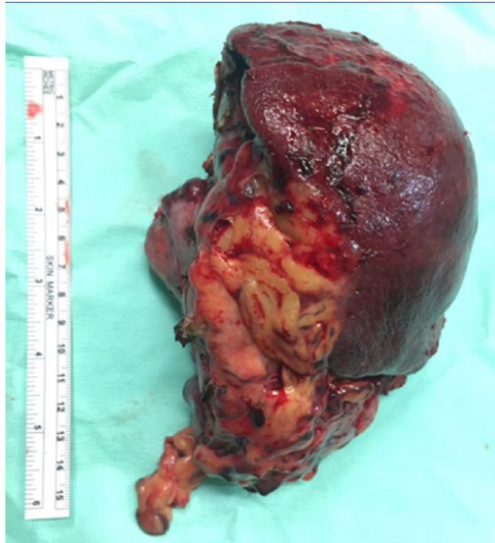
Figure 2: Macroscopic picture of splenectomy and distal pancreatectomy specimen