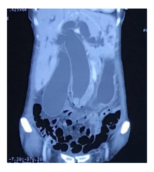
Figure 2: Computed tomography showing dilated lesions on coronal view