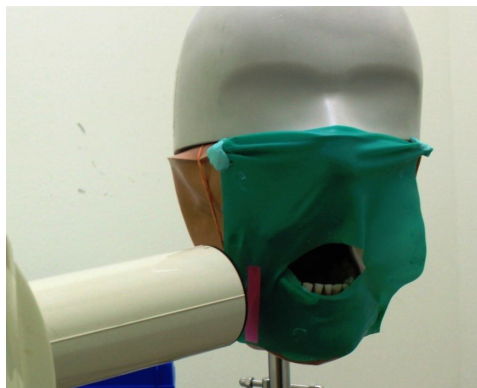
Figure 1: A working model used by students in this study. Noted here as well, a red rectangular sticker which was used as external marker in BAT-M.

Each full mouth periapical survey performed by a dental student who participated in this study was carried out using a complete set of permanent dentition model mounted onto a simulation phantom head. This served as a working model (Figure 1) that