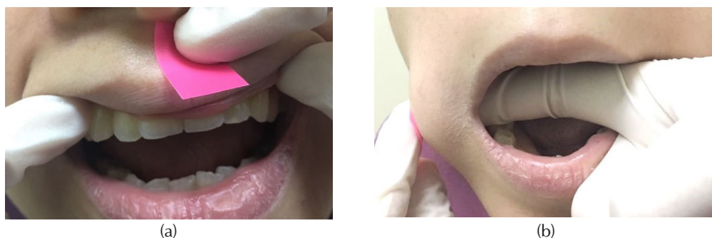
Figure 3: a) Identification of surface landmark of an anterior tooth by direct visualization of the tooth; b) For posterior teeth, an index finger is placed on the tooth of interest. At this level, the index finger is projected toward cheek until a soft tissue prominence can be seen to outline the specific region for the placement of the external marker.