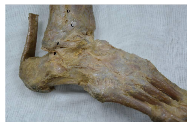
Figure 2: Right ankle joint of the cadaver. A: Anterior talofibular ligament B: Calcaneofibular ligament C: Anterior tibiofibular ligament D: Interosseous membrane

The medial side of ankle is protected by medial ligament. It is also known as deltoid ligament. It has four strong, large ligamentous bands which attach proximally to the medial malleolus, then spread out to attach distally to the talus, calcaneus and navicular bone (Nancy et al. 2012). These four ligamentous bands are known individually as anterior and posterior tibiotalar, calcaneotibial and tibionavicular ligaments. The deltoid ligament is crossed by tibialis posterior and flexor digitorum longus muscles.