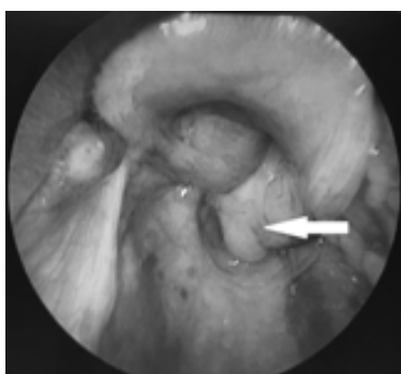
Figure 2: The figure shows a direct laryngoscopy view depicting distorted laryngeal structures with right arytenoid anteriorly displaced (white arrow)

incision around the lesion. Direct laryngoscopy revealed massive suprastomal granulation. At the end of the procedure, a new cuff TT tube was inserted that managed to bypass the distal granulation tissue.