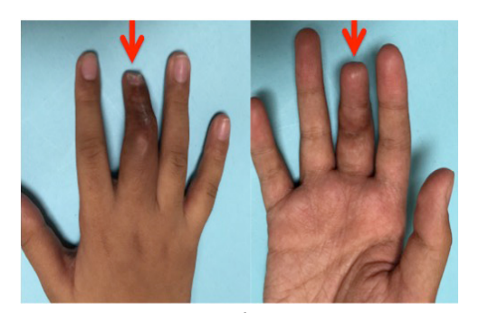
Figure 3: Post-revascularisation at 3 years: Excellent function with good cosmesis except finger is short due to destruction of growth plate at the distal interphalangeal joint.

A 42-year-old male sustained a machete attack with a near total amputation of his right small and ring finger attached only by 2 cm of dorsal skin with a jagged wound. His fingers were dusky and capillary refill time was more than 4 seconds. We proceed with revascularisation of both his fingers. Only one digital artery to each finger was anastomosed intraoperatively. However, the quality of the digital artery was questionable.