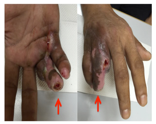
Figure 6: Post-revascularisation at 4 months: Fingers are pink with some hypopigmented region. Serous discharge seen from part of the wound.

At post-operative day 9, the fingers developed blistering, the wound looks wet and the skin appeared unhealthy (Figure 4). The pulp was black although pulp turgor was maintained. Pin-prick bled red arterial bleeding. We decided to wait for demarcation of the fingers rather then deciding for amputation. We reviewed this patient weekly in clinic. At 16 days post-operative, the pulp is still black but the skin over the proximal and middle phalanx was pink and healthy (Figure 5). At 4 months follow-up, he still had minimal serous discharge from the wound (Figure 6). His function was poor with stiffness and hypoaesthesia. Although we had advised him to stop smoking to accelerate wound healing he was unable to do so. He was also noncomplaint to physiotherapy.