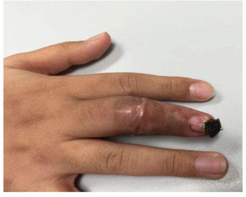
Figure 2: Post-revascularisation at 7 weeks: The skin has turned into a normal pink colour with just a tip of necrotic tissue

The condition of middle finger of the patient actually slowly improved every week. At 7 weeks post-operative, we were delighted to see new pink skin as the black, dry skin had desloughed off (Figure 2). At 3 years follow-up, he had excellent function and cosmetically good outcome. Nevertheless the finger was shorter than normal and sensation was reduced at 2/10. Motion was also reduced with 0-45 degree active motion at the proximal interphalangeal joint and a fused distal interphalangeal joint (Figure 3).