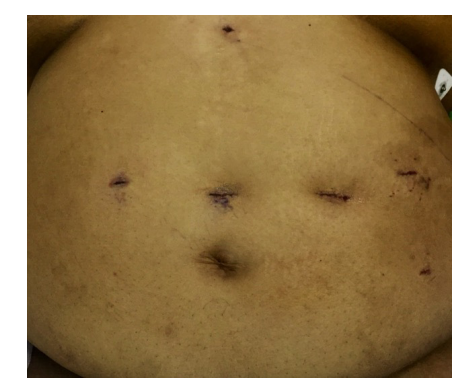
Figure 5: Photograph depicting the immediate post-operative scars following a conventional 5-port (or 5-incision) laparoscopic sleeve gastrectomy